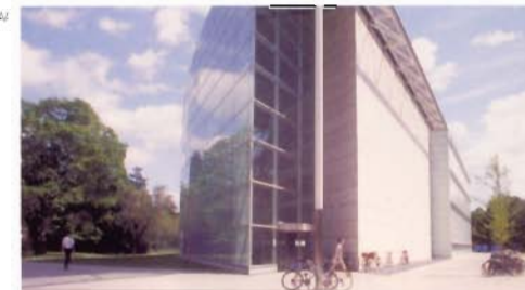
Faculty of Law