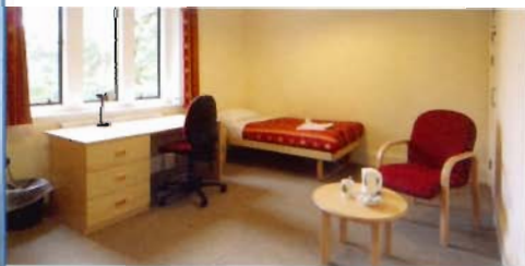
En suite bedroom, Selwyn College. An example of the accommodation offered for Option A

For family and other non-College accommodation, you will need to apply as a non-resident for the English Legal Methods Summer School and make your own accommodation arrangements. Visit www.visitcambridge.org for further information. The University accepts no responsibility for finding accommodation for those applying for non-residential places.