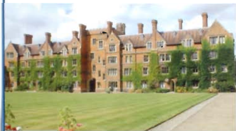
Selwyn College buildings

W10 Family Law - Divorce law and policy: reforms, domestic violence, property, including maintenance, property re-allocation on divorce, children, and private and public law aspects.