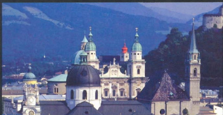
University of Salzburg Law Faculty